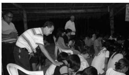
Praying for people who committed their lives to Christ

However, during the past few months, our Outreach was very carefully carried out as people were confused and distracted. Five people accepted Christ as personal Saviour at our Easter Rally on 3 rd April at Pouki garage. A young man opened his heart to Christ on Sunday 4 th April at TPTL Saimai Blessed Church which is close to the head office of the Red mob in the outskirts of Bangkok.